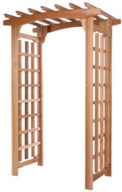
Single Arbor Example