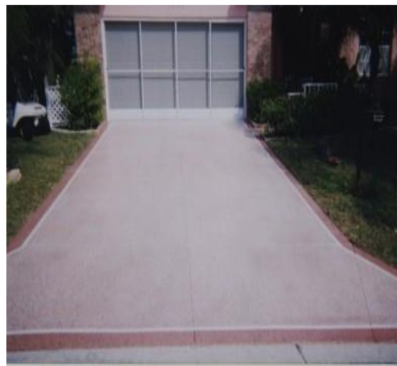
Single Home or Villa Driveway

A single graphic design is allowed on driveway and portico of single family homes. Color selection must come from Heritage Pines Driveway Color Book and must be a two color process